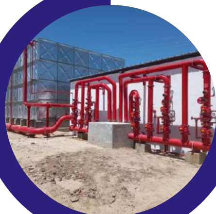
Sprinkler ICV's & Water Storage Tanks