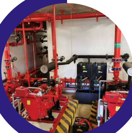
Sprinkler and Hydrant Pump Set