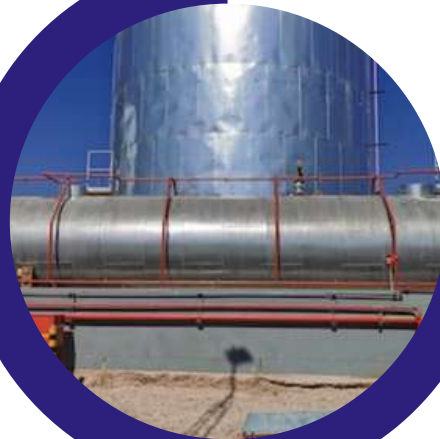
Automated Fire Protection