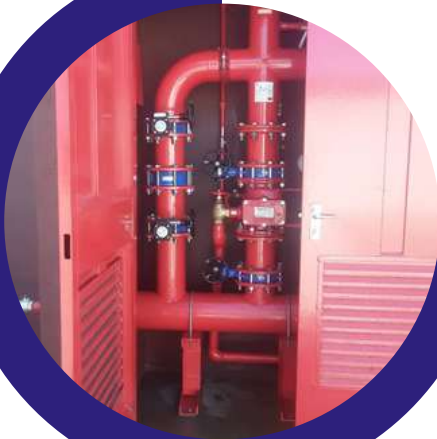
Automatic Fire Sprinkler System ICV