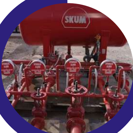
Foam Automation Systems