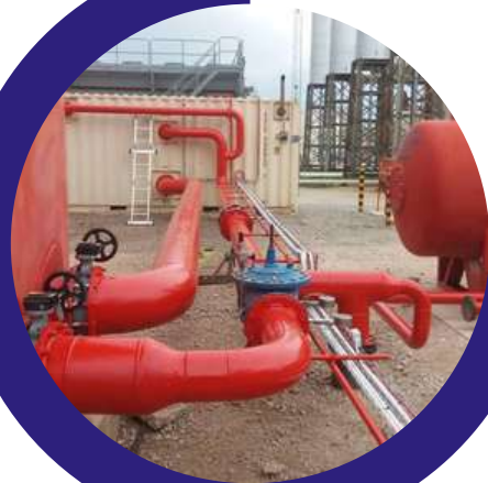
Foam System Installation B2Gold