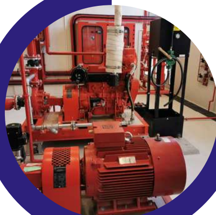
Sprinkler Pump Set