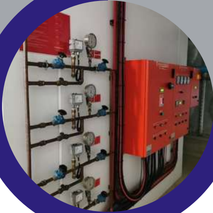
Sprinkler & Hydrant Fire Pumps Installation